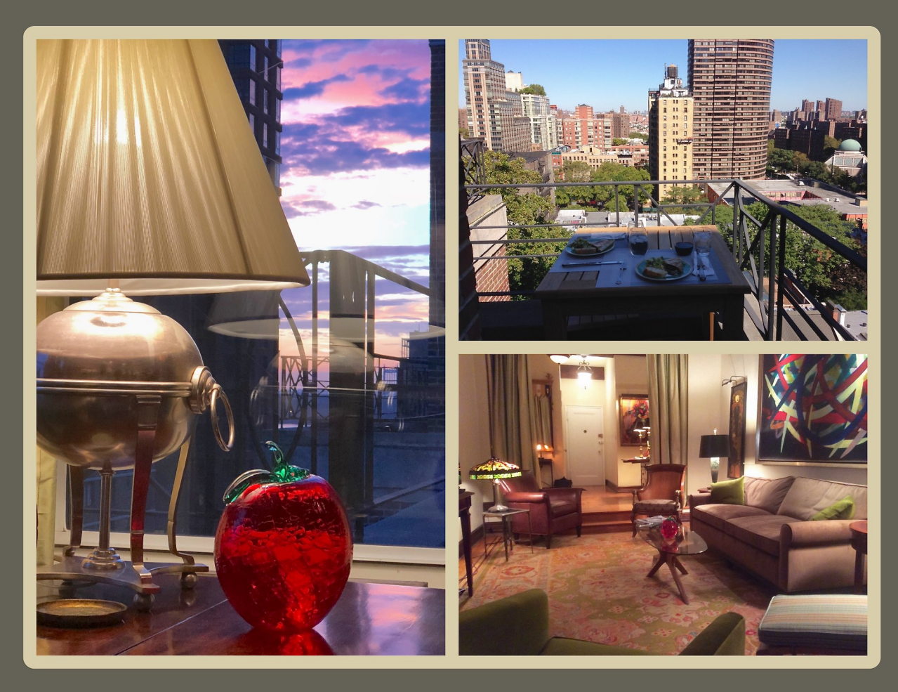
IT'S UP TO YOU NEW YORK! NEW YORK!